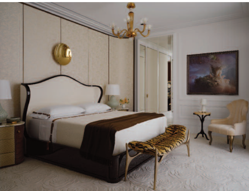
Above: the bedroom suites are a study in sensorial luxury with silk wall coverings, and a cocoon-like bed structures they create a space of retreat and repose. Right-hand page: the bedroom suites are a study in sensorial luxury with silk wall coverings, and a cocoon-like bed structures they create a space of retreat and repose. This page: the bathrooms are a masterclass in material richness, burl wood, onyx, polished brass, and a freestanding tub framed by shimmering metal beads that glint like desert rain.